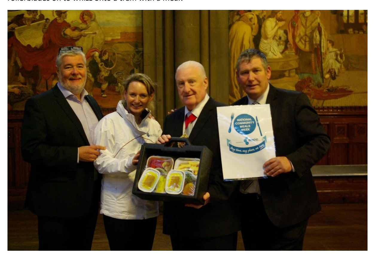
We were then special guests at Manchester Town Hall.