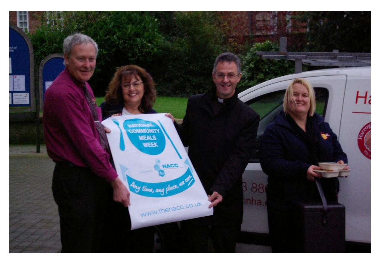
The meal was then transported by Harrogate Food Angels to be blessed by the Dean of Ripon at the cathedral.